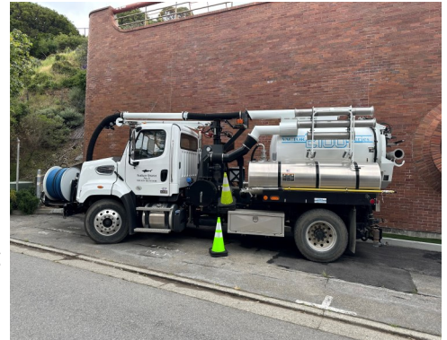
District's Vactor truck used for sewer line cleaning purposes

cleaning cycle, on a typical cleaning day the truck will be filled up to 8 times in single day for sewer cleaning purposes. In the District's ongoing pursuit of seeking ways to conserve and minimize costs—staff applied for and received permission from the water board to use treated wastewater from the Main WWTP in Tiburon for the use of cleaning sewers and thus doing our part to help conserve precious potable water.