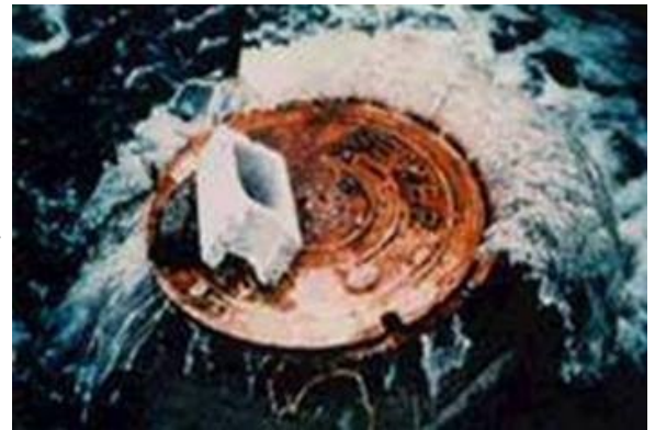
Don't worry, this photo was NOT taken in Sanitary District 5!

Once the grease can is full, place it in the trash along with other absorbent material like paper towels or kitty litter.