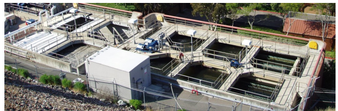
Sanitary District No. 5 of Marin County Main Treatment Facility

will be given, along with an opportunity for questions and answers. We look forward to seeing you. Please phone the District at 435-1501 to schedule your tour.