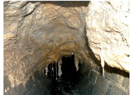
Disposing of fats, oils, and grease down the drain can quickly lead to clogs like this! Do your part to keep it out of the sewers.