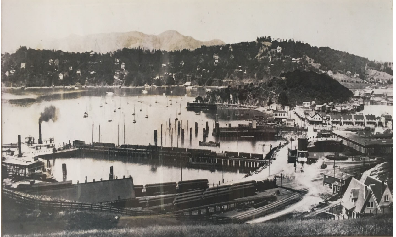
1920's era –Tiburon Peninsula- Location of future Waste Water Treatment Plant