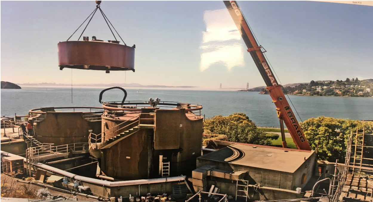
2014 – Tiburon Peninsula –Main Plant Rehabilitation at Wastewater Treatment Plant