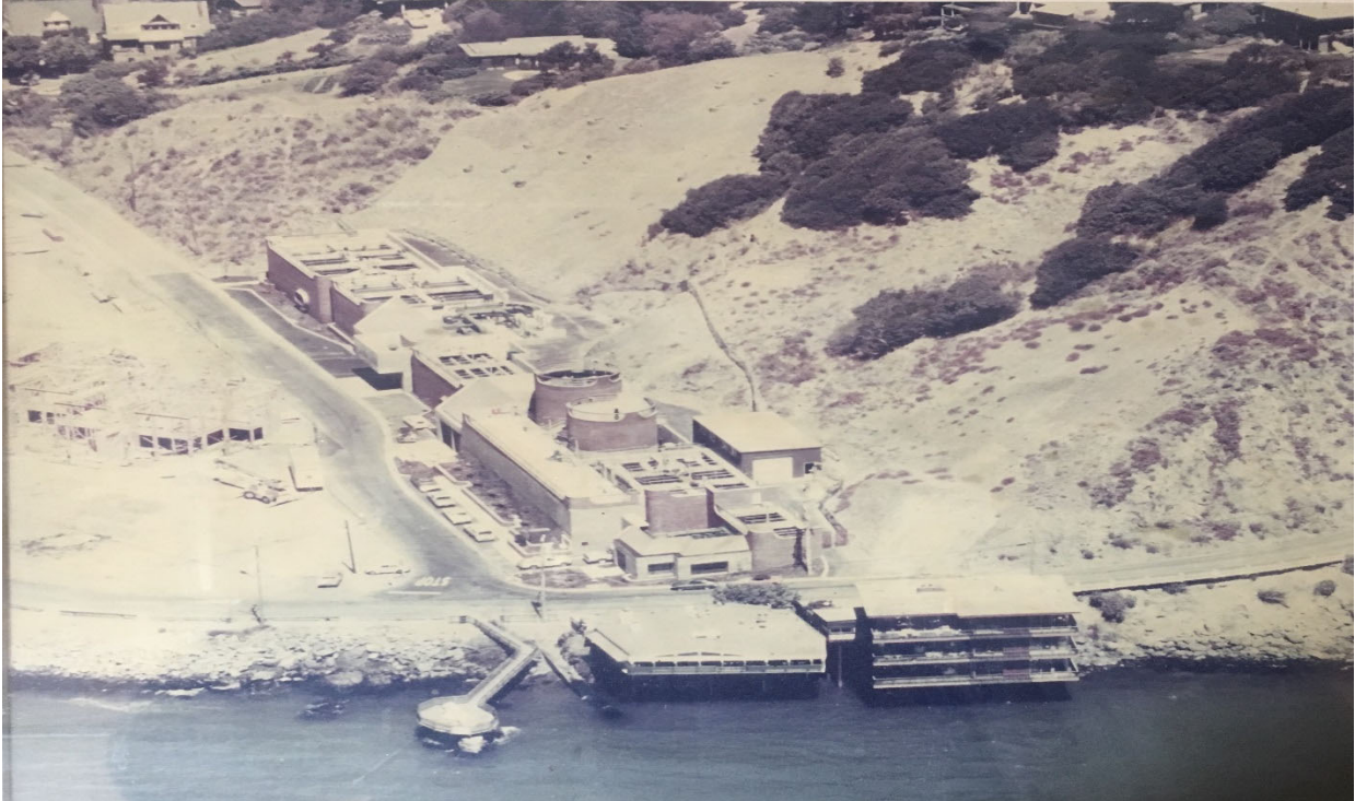
1980's era- Tiburon Peninsula- Secondary Treatment additions to Wastewater Treatment Plant