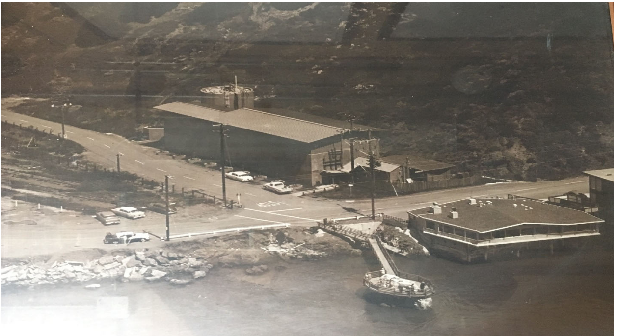
1960's era- Tiburon Peninsula – Wastewater Treatment Plant in service- Primary Treatment only