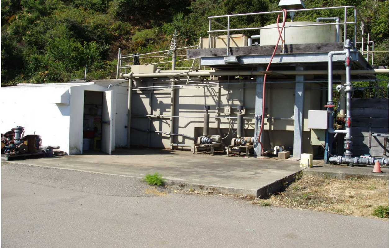
1980's era Unincorporated East Tiburon -Paradise Cove Wastewater Treatment Plant