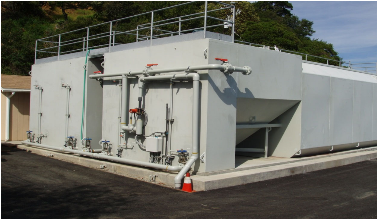
2010 Unincorporated East Tiburon- Upgraded Paradise Cove Wastewater Treatment Plant